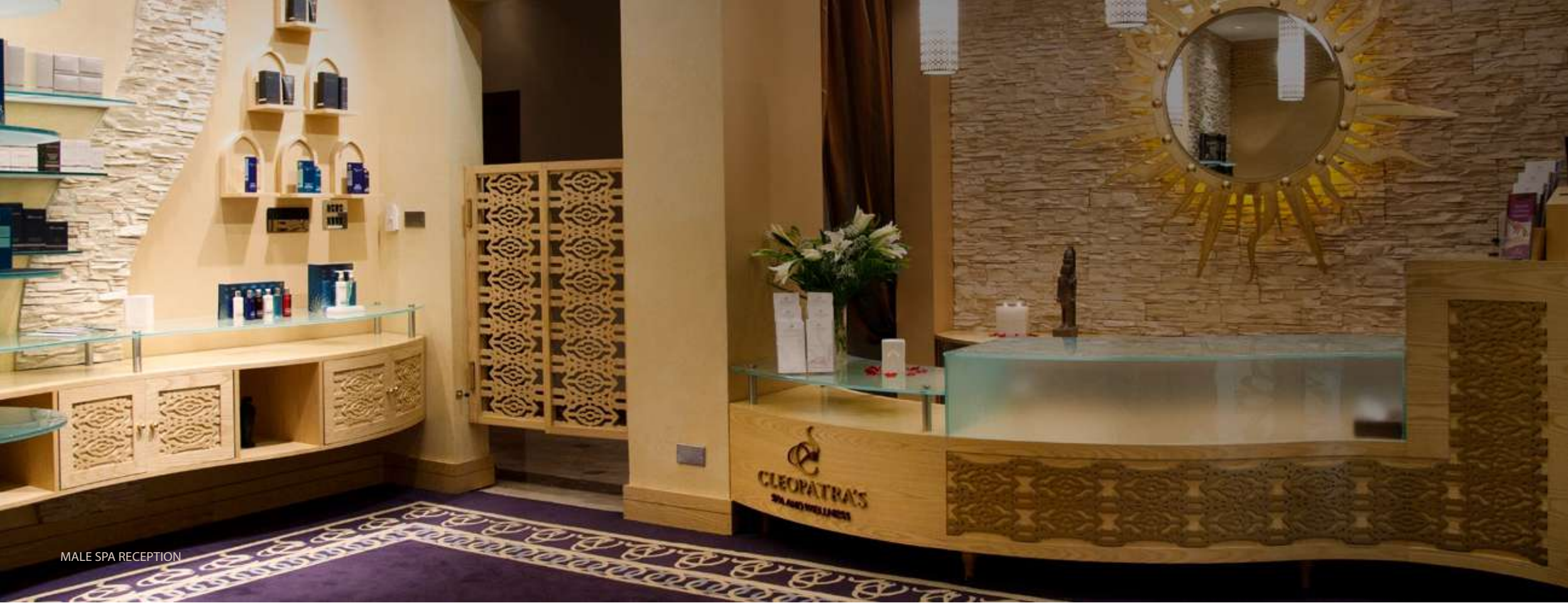
MALE SPA RECEPTION